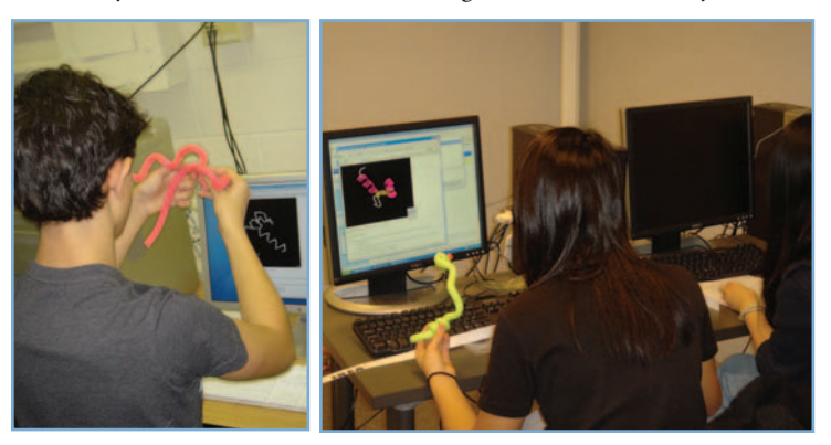
At the event, teams modeled a portion of PDB entry 1cll.

In addition to providing the kits, the Protein Modeling event in New Jersey is judged by the annotators and computer programmers of the RCSB PDB. They review each structure by comparing it to a 3D model generated directly from the coordinates and using a model built directly from the