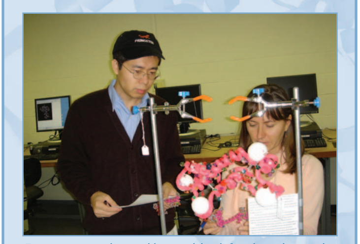
Entries were compared to a model generated directly from the coordinates and a pre-determined rubric.

ing recognition for outstanding achievement in science education by both students and teachers.