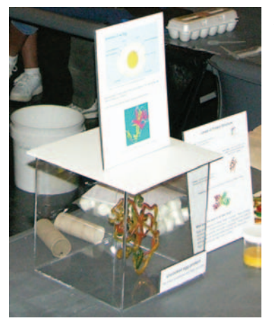
Close-up of protein model

We searched for images online that were created with protein modeling software (cartoon images) and followed these to create a threedimensional model of the tertiary structure of the ovalbumin protein found in eggs. A folded protein model was made using a thin wire frame wrapped in Fruit by the Foot<sup>TM</sup>. An unfolded, twisted mass of Fruit by the Foot<sup>TM</sup> was used to represent the denatured egg protein. These two models, along with a raw and cooked egg, were used to teach visitors about: (1) what proteins are; (2) how they are made; and (3) the different levels of protein structure.