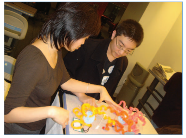
RCSB PDB judges also met with students to discuss their structures.

structure's PDB file and a predetermined rubric that awards points for accurate depictions of the protein's features. For example, judges look to see if the N- and C-termini are labeled properly and carefully consider the helices of the model. They also consider if the main functional and struc-